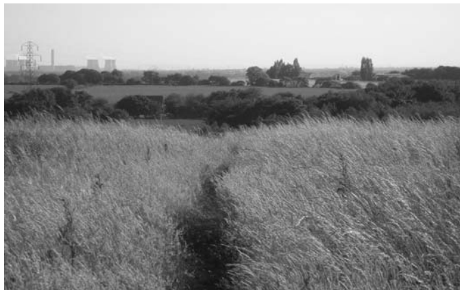
View across the site

THE IMPACT OF THE PERIOD OF CONSTRUCTION OF THE NEW JUNCTION AND INCREASED TRAFFIC CONJESTION AS THE DEVELOPMENT CAME INTO USE IS SOMETHING WE SHOULD ALL BE EXTREMELY CONCERNED ABOUT. CAN YOU CONTEMPLATE TRAFFIC CONDITIONS IN AND AROUND WINWICK IF SOMETHING HAPPENS TO BLOCK THE M6 AND TRAFFIC DIVERTS THROUGH WARRINGTON?